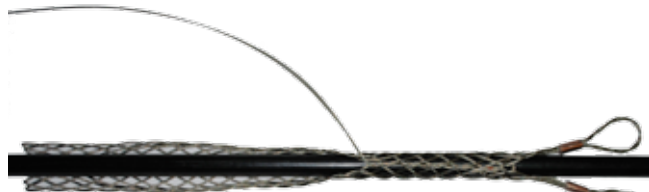
Type C Lace-Up Twin Eye Single End